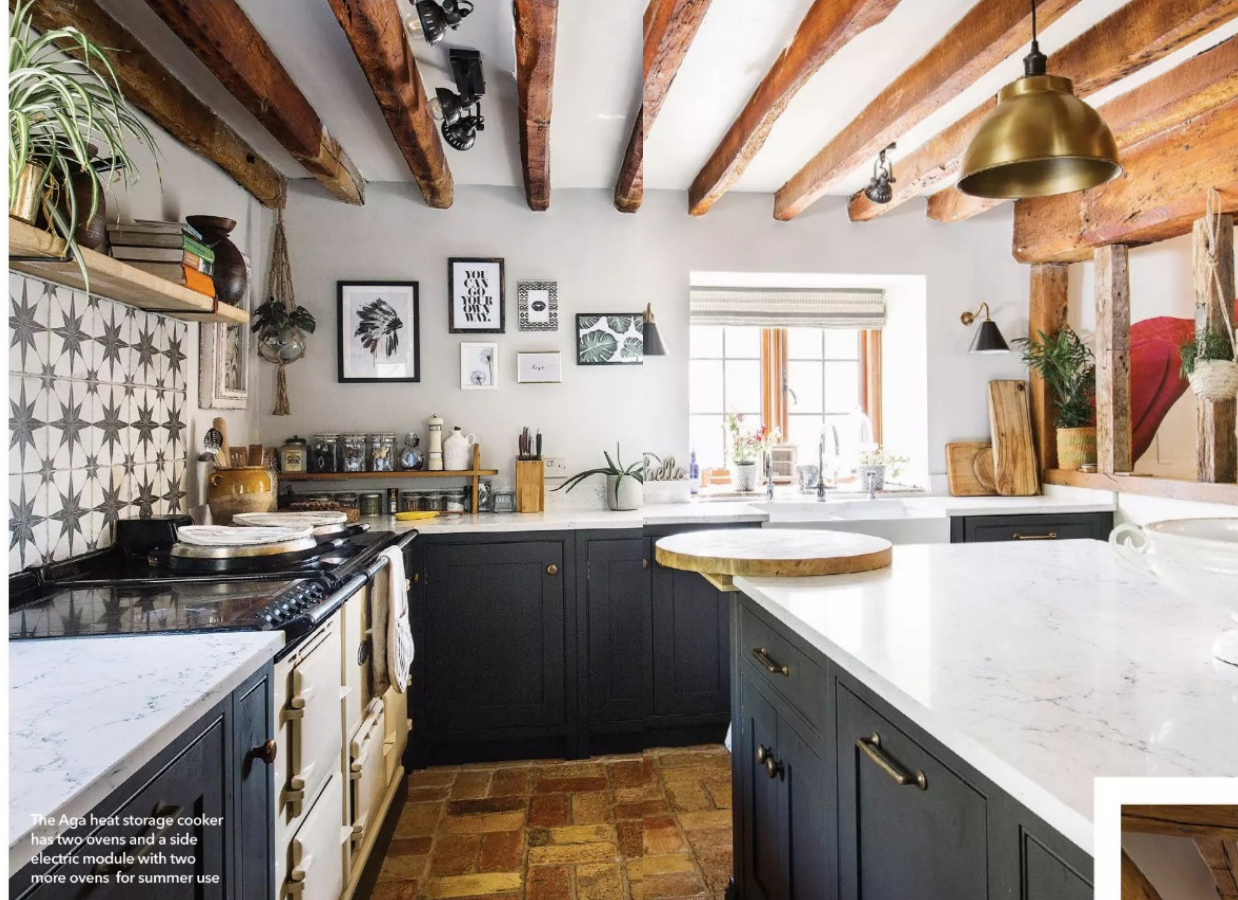
The Aga heat storage cooker has two ovens and a side electric module with two more ovens for summer use