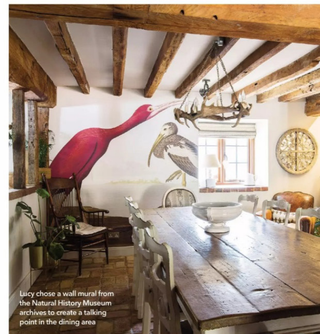
Lucy chose a wall mural from the Natural History Museum archives to create a talking point in the dining area

A large island, measuring 2.6x1.2m, forms the central feature of the room, complete with storage, work surface and bar stools for socialising. It is surrounded by a wet zone with sink and dishwasher, cooking area with large Aga, corner fridge and larder and breakfast cupboards with dresser unit extending into the dining area and linking the rooms.