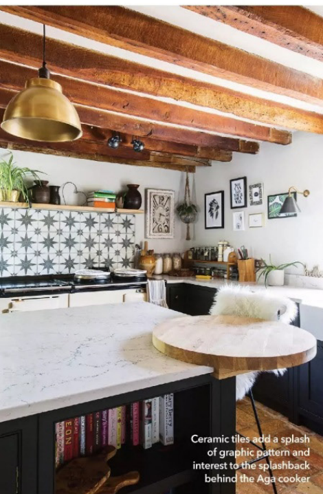
Ceramic tiles add a splash of graphic pattern and interest to the splashback behind the Aga cooker